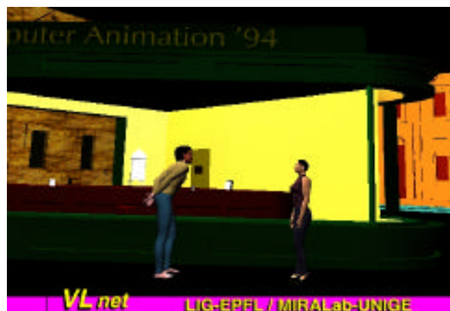
Figure 4 Two subjects interacting at the bar

Then, it is interesting to notice that the users have been able to reproduce, through the mechanisms of nonverbal communication, their relationship of the real world in the virtual environment. The subjects that didn't know each other before the experiment situated themselves at a bigger interactional distance than the ones who were familiar, and this is typical of what the study of proxemics has showed. Moreover, they carefully avoided all the aggressive gestures when the other ones (who knew each other) used several times the « mockery » gesture or the forearm jerk.